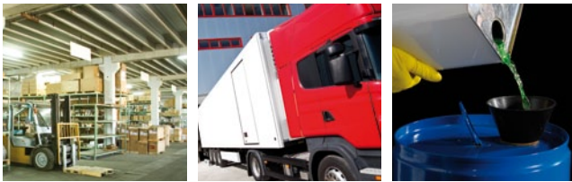
* The B-EX4T2 was benchmarked against competitor products in stand-by mode.